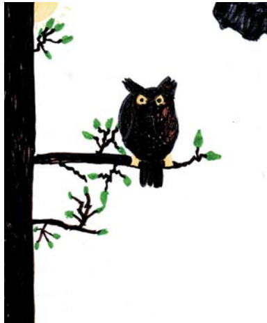
"Hoot Boot" by Luke Gray