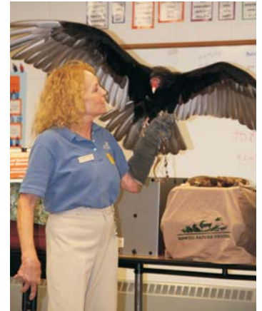
Howell Nature Center handler with Great Horned Owl (above left) and Turkey vulture (above right).

professional, funny, speak age appropriately and extremely knowledgeable about each bird. The Turkey Vulture was a big hit on all three days, Egor was a show off, keeping his wings open the entire time. The other birds visiting were a Peregrine Falcon, Merlin, Red-tailed Hawk, Broad-winged Hawk and a Great-horned Owl. The Howell Nature Center will bring Kili the Bald Eagle, on request, at an additional charge.