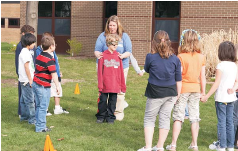
Above: Students pretend to be prey for raptors.

Alexandria's Nature Bus started visiting local Michigan schools in April. They started with St. Joe's in Howell, Webster in Livonia and Blanche Sims in Lake Orion. The Howell Nature Center has the Birds of Prey Program geared towards grades 3-7, though any age child or adult would enjoy the entire program. The age range of children who experienced the Nature Bus Program in April were third graders and fifth through eighth grade children. Each student completed the hands-on activities aboard the bus, participated in birds of prey simulation games and watched a live raptor presentation inside their school.