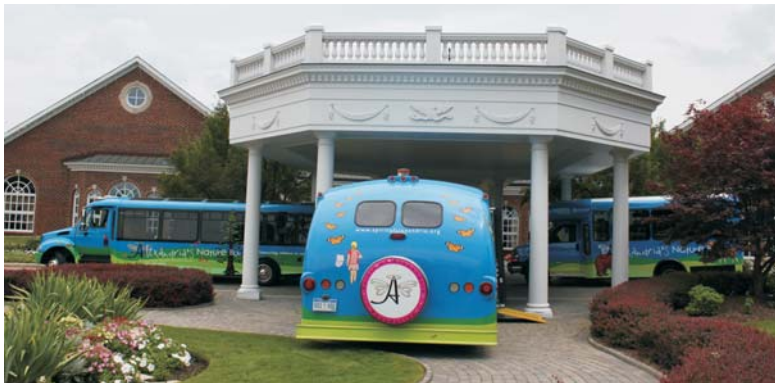
All 3 Alexandria Nature Buses on display at 4th Annual Golf Outing.