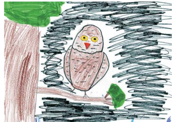
Owl by Reagan