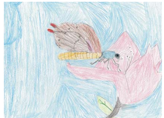
Butterfly by Serena