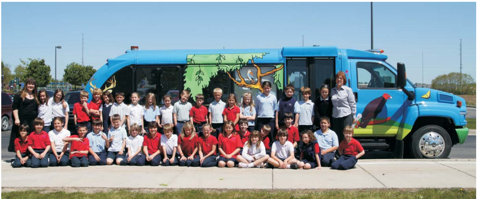
Alexandria's Nature Bus visits Charyl Stockwell Academy - 2010.