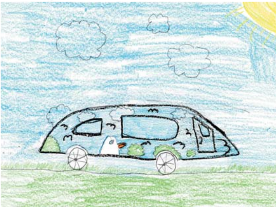
"Nature Bus" by Max Glover