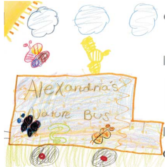
Alexandria's Nature Bus