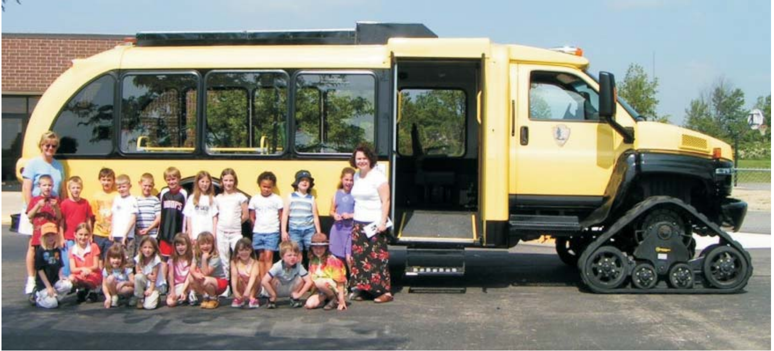
The Yellow Bus visits Charyl Stockwell Academy - 2003.

On May 18th and 19th Alexandria's Nature Bus went to Charyl Stockwell Academy, where all Voyager students participated in the 2 hour program (3 separate programs to accommodate 200 students) provided by the Howell Nature Center experienced staff.